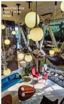
View of the Living Room from the bridge