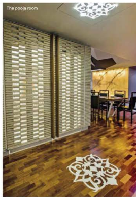
The pooja room