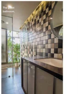
The guest bathroom.