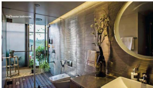
The master bathroom

All the five bathrooms have individualistic characters and stories to recite. The original bathrooms were broken and pushed into a central space which now has glass windows looking out. All the bathrooms are made to look outdoors, with a small pebbled internal or external area towards the glass, to brighten each of them.