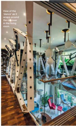
View of the "dance" as it wraps around the cut-over in the living room.

The whole volume of the house that sits on the fourth and fifth floor of an apartment is divided into an invisible grid, derived from the central open spaces and the floor