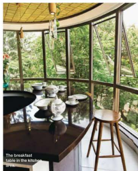
The breakfast table in the kitchen area.