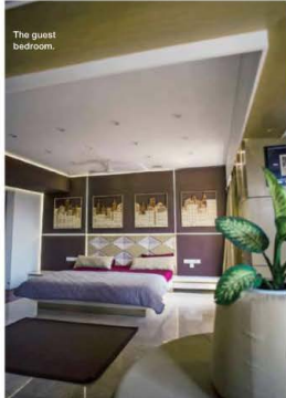
The guest bedroom.

converted into cubboards and storage," states Gaurav. These are made in veneer, but also coloured in a light grey, to keep the colour palette neutral. Initially, the walls were very basic and looked tedious in the bedroom but started to become more dynamic as soon as they moved into the common spaces. They developed into light walls with the patterns