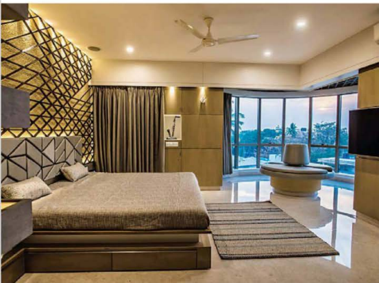
The master bedroom from the entry at sunset.

that articulate the invisible lattice of the house.