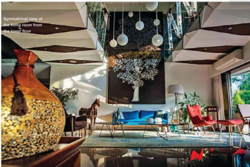
Symmetrical view of the living room from the lower floor