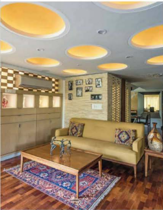
The den at the lower level

dismantle all the walls and create a single apartment. The brief demanded five bedrooms comprising one master and one guest, one each for their three children. It also required a big kitchen, dining, a formal and an informal living room. A library was very important to them since most of their time is spent in the same (with an AV room), where the family regularly gets together.