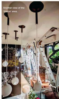
Another view of the 'dance' area.