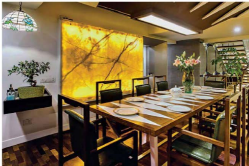
The dining room.